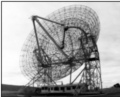
A local landmark, the "Big Dish" was built and is operated by SRI engineers for the U.S. Government.

the bottom of checks. You may also know that the area around the "Dish" radar facility in the hills above Stanford University is a popular place for hiking and running. But did you know that SRI built and operates the Dish for the U.S. Government? Among its other uses today, the Dish provides the first calibration for GPS satellites put into orbit.